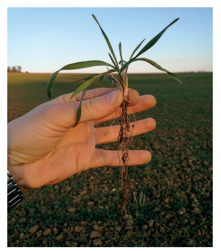
The crop is usually firmly rooted