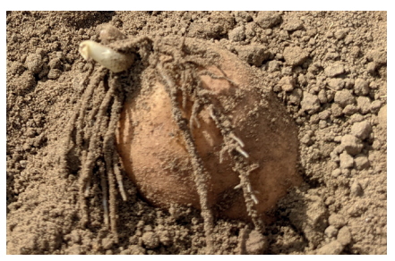
Pay attention to the plant stage